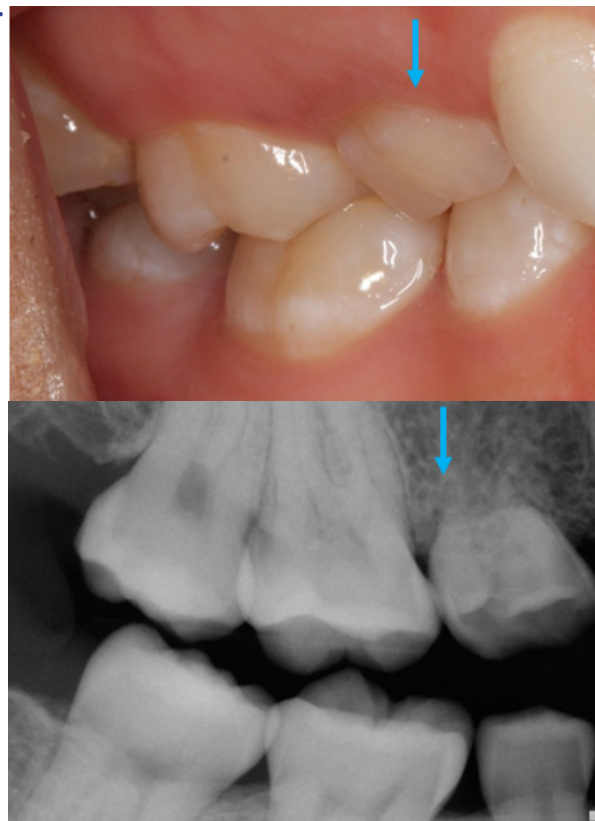
Loose and discoloured baby tooth shown with arrow